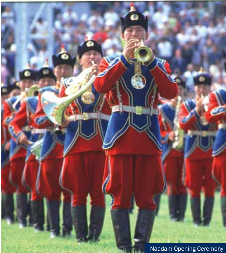
Naadam Opening Ceremony

“ We loved the Naadam Festival spectacle and mixing with the locals. We saw traditions, costumes and a country very different from the other places we have visited. ”