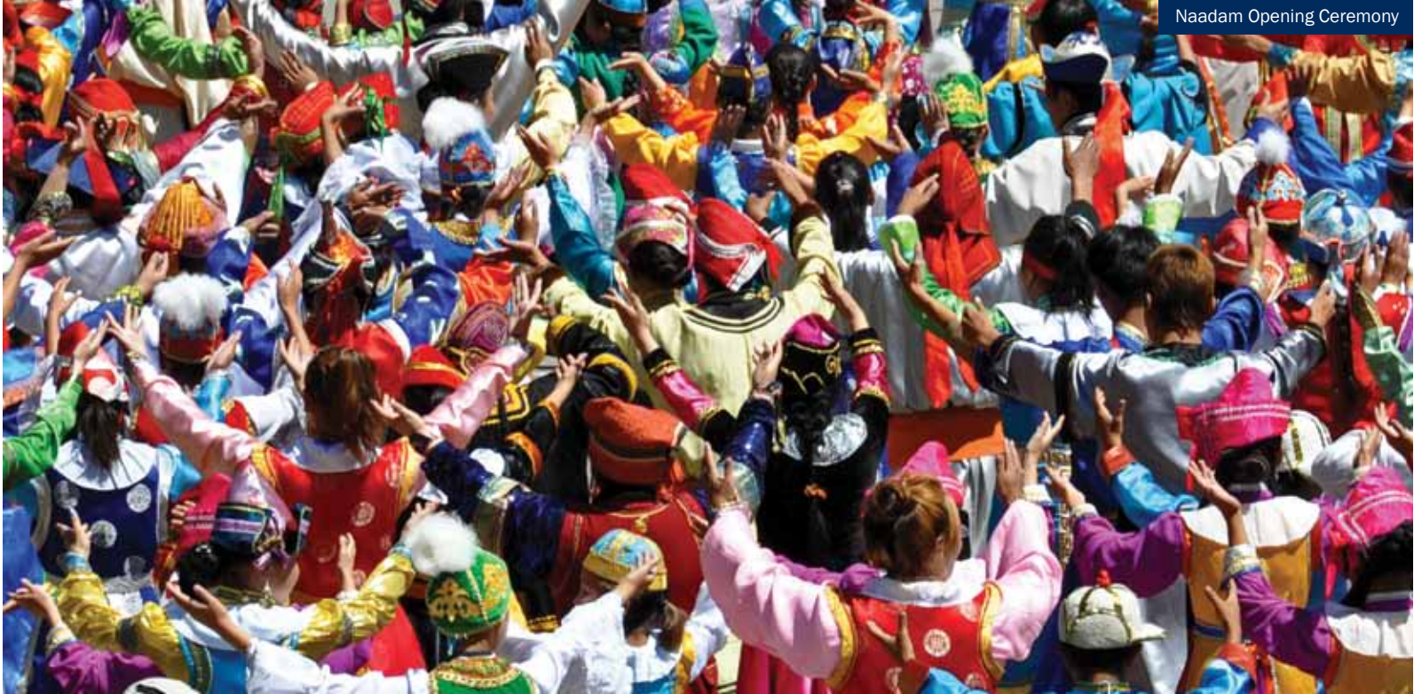
Naadam Opening Ceremony