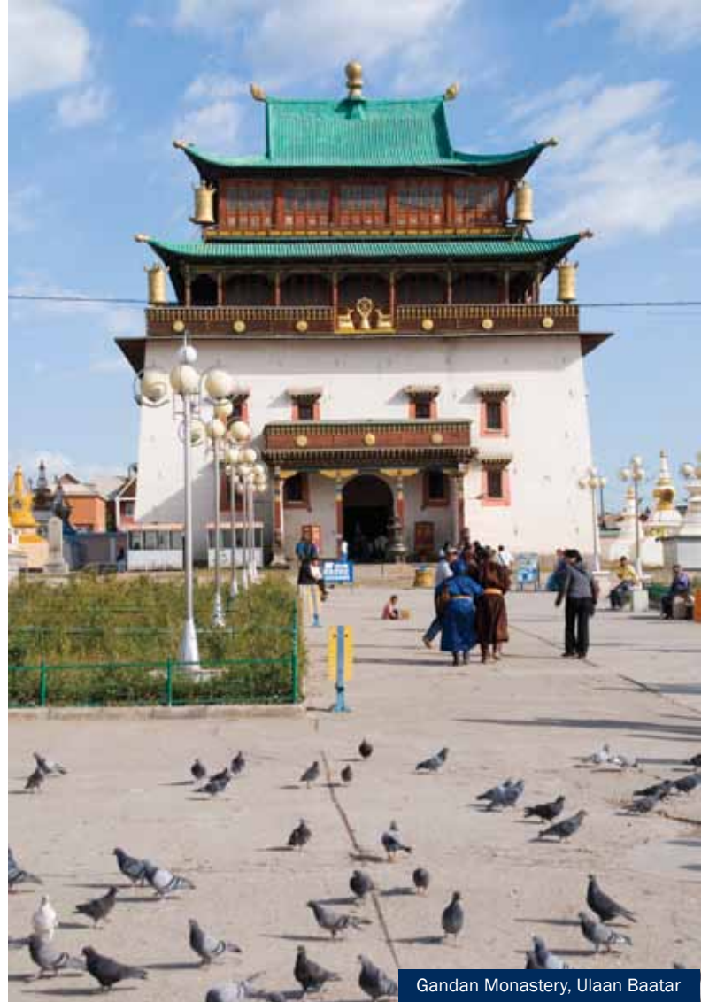
Gandan Monastery, Ulaan Baatar